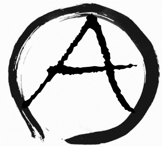
An A inside a circle is the traditional symbol for anarchy.

In an anarchy , nobody is in control—or everyone is, depending on how you look at it. Sometimes the word anarchy is used to refer to an out-of-control mob. When it comes to government, anarchy would be one way to describe the human state of existence before any governments developed. It would be similar to the way animals live in the wild, with everyone looking out for themselves. Today, people who call themselves anarchists usually believe that people should be allowed to freely associate together without being subject to any nation or government. There are no countries that have anarchy as their form of government.