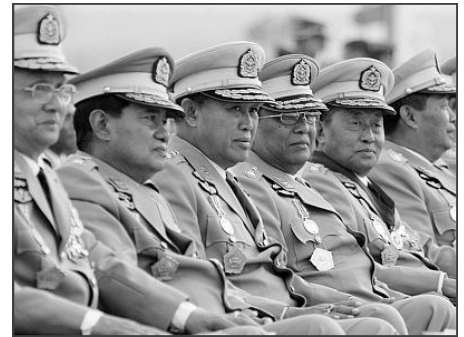
From 1962 to 2011, Myanmar (also known as Burma) was ruled by a military junta that was condemned by the world for its human rights violations.

In an oligarchy (OH-lih-gar-kee), a small group of people has all the power. Oligarchy is a Greek word that means “rule by a few.” Sometimes this means that only a certain group has political rights, such as members of one political party, one social class, or one race. For example, in some societies, only noble families who owned land could participate in politics. An oligarchy can also mean that a few people control the country. For example, a junta is a small group of people—usually military officers—who rule a country after taking it over by force. A junta often operates much like a dictatorship, except that several people share power.