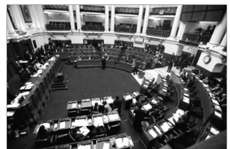
The Peruvian legislature