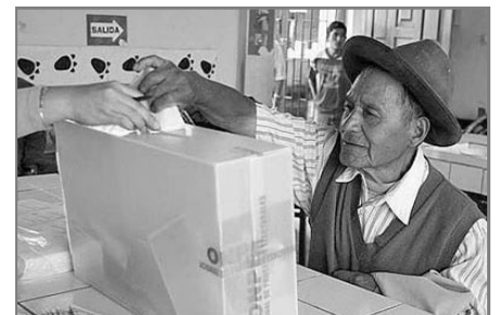
A man votes in Peru.

In a direct democracy , there are no representatives. Citizens are directly involved in the day-to-day work of governing the country. Citizens might be required to participate in lawmaking or act as judges, for example. The best example of this was in the ancient Greek city-state called Athens. Most modern countries are too large for a direct democracy to work.