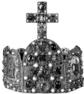
Crown of the Holy Roman Empire, which was tied to the Catholic church and lasted from the 10th—19th century.